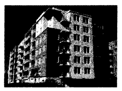
A commercial apartment building often reviewed in a property condition assessment or lease verification inspection.

1. Municipal Government Building Inspection: This is a mandatory inspection for compliance with the building code. It is to assure compliance with the law and the building code adopted. In the State of Pennsylvania it is the state wide Uniform Construction Code enacted in 1999. The specifics of the inspection is determined by the building permit work and the type of work being completed. It may be a building, plumbing, electrical, mechanical, structural, fire protection, accessibility and ADA requirements, energy compliance, elevators, or another type inspection or a