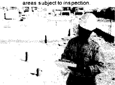
A commercial building inspector at work either performing a code inspection or a construction draw inspection.