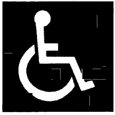
ADA Conditions are part of the property condition assessment.