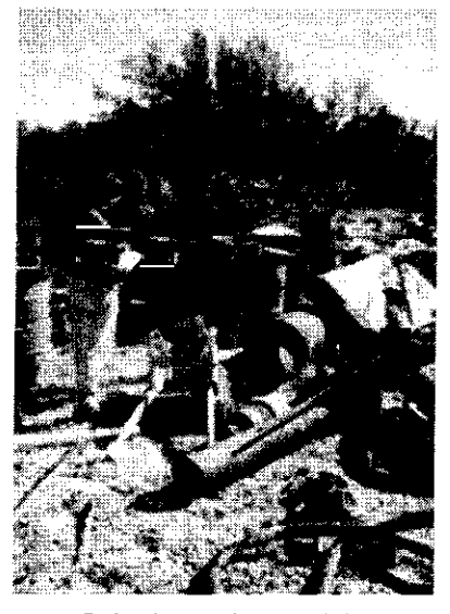
Performing a environmental site assessment.

2. Property Maintenance Inspection or Commercial Building Inspections: This second type of inspection is a grown up home inspection for residential and commercial buildings and their sites. It is often completed for the same reasons a home inspection is requested by a home buyer. The potential purchaser of the commercial building wants an assessment of the property and its components to learn its conditions and to negotiate a better purchase price if it is warranted or just to obtain leverage or feel comfortable with the purchase. There are inspection firms which try to define the standards of the inspection here but in the end it is between the inspector and the client as to what inspection standards will be conducted or the scope will be. The commercial inspections standards are different than a home or residential property inspection due to the more complex components that will